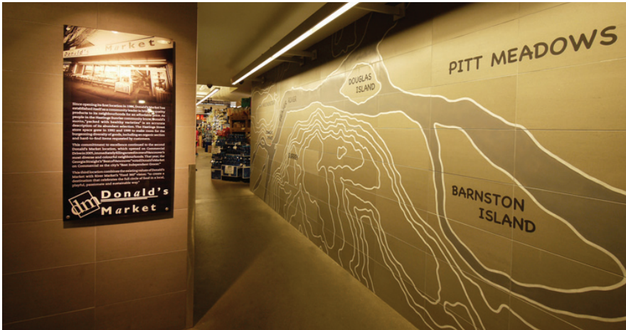
entry from inside River Market

The existing concrete floor was used as a finished floor and the ceiling was left open as a strategy to reduce material use. Directed lighting draws attention to the product and away from these surfaces. Energy-efficient fluorescent T5 luminaires over the aisles direct light onto the vertical face of the store shelves and high-CRI metal halide track lights enhance the colours and textures of fresh fruits and vegetables.