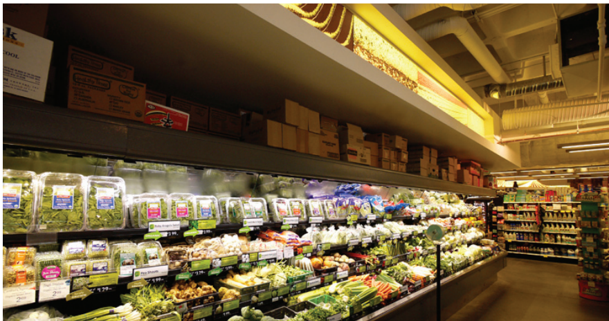
cooled produce section with illuminated panels

The use of low-emitting materials such as paints, coatings, adhesives and sealants, help maintain a healthy indoor air quality. Agri-fibre core doors and medium density fibre-board panels contain no added urea formaldehyde.